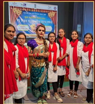
Red Ribbon Club Activity