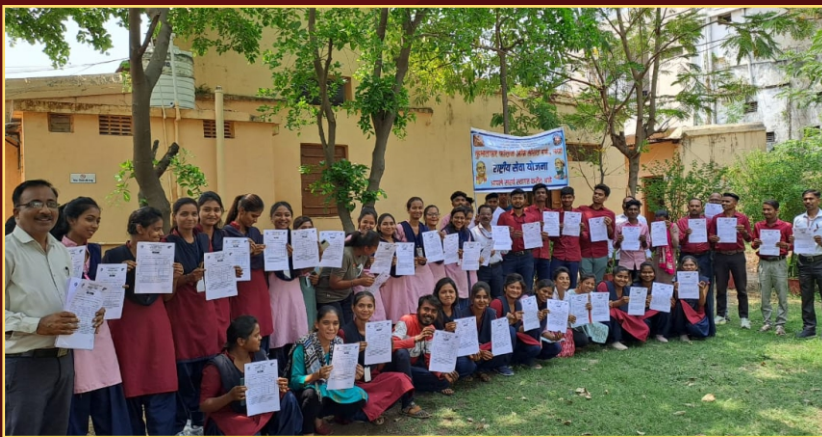
Voter Awareness Program