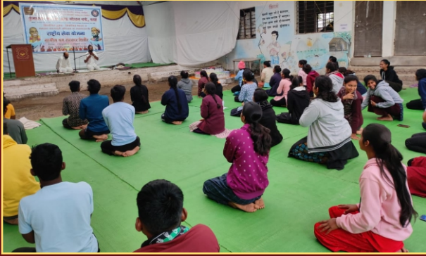
Yoga & Health Awareness Session