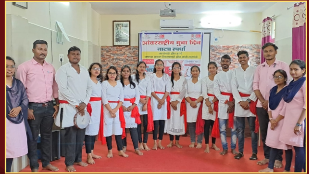
International Youth Day – Drama Competition