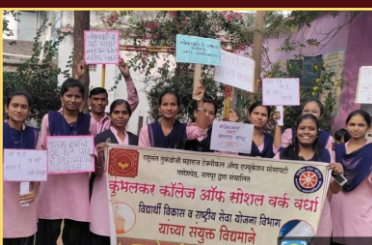
Constitution Awareness Program