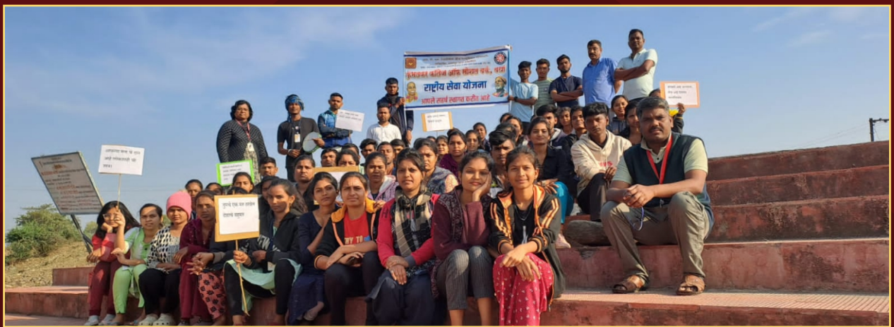
Skill Lab & Experiential Learning Activity