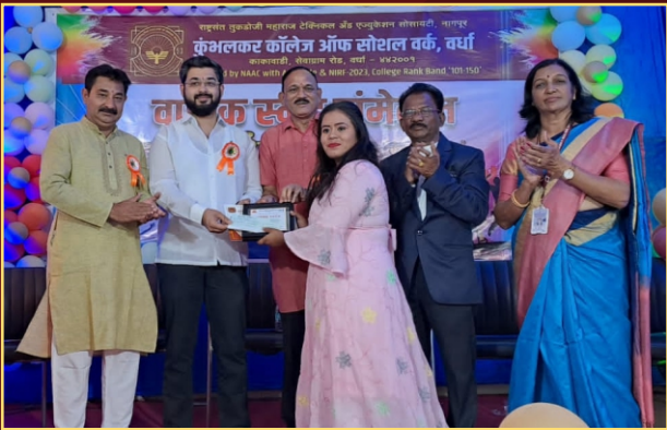
Sankalp : College Magazine Inauguration Event