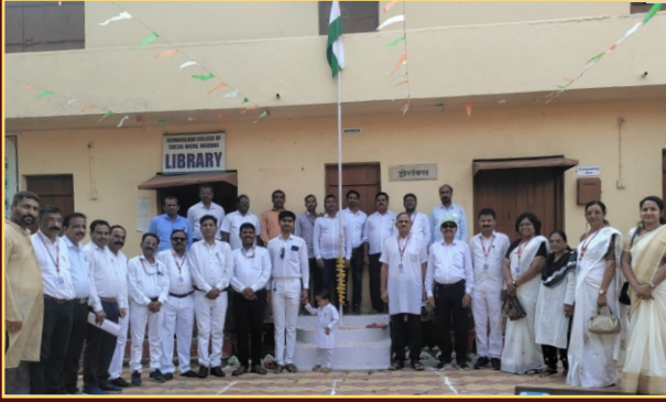
Field Work – Agency Visit