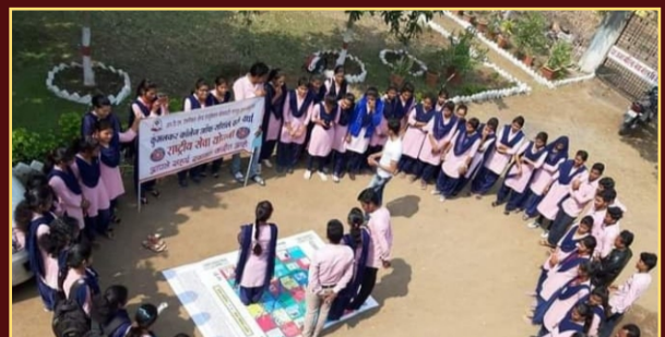
Employability Enhancement Program