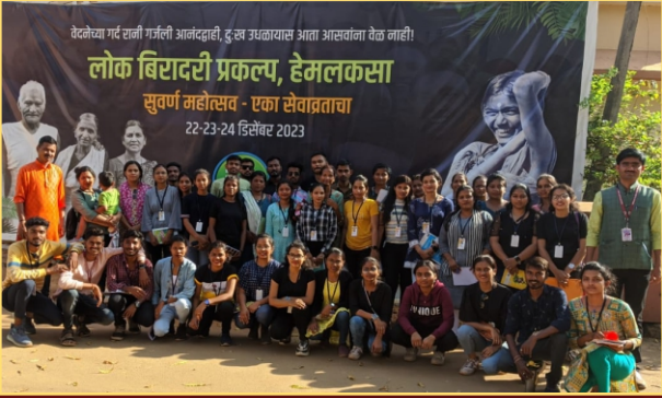
MSW Study Tour at Hemalkasa