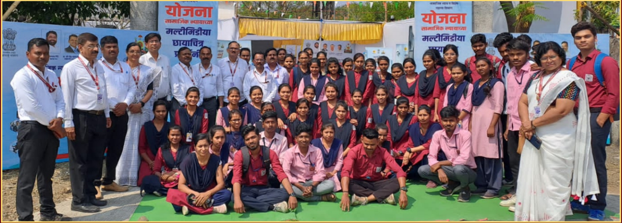
Voter Awareness Program Rally