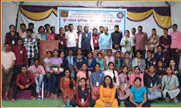
NSS Village Camp